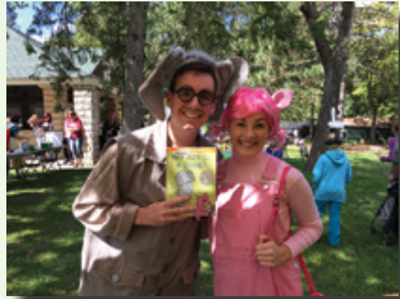
United Way Block Party