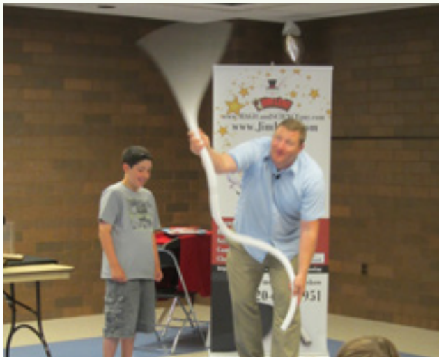
Summer Library Program Science Show