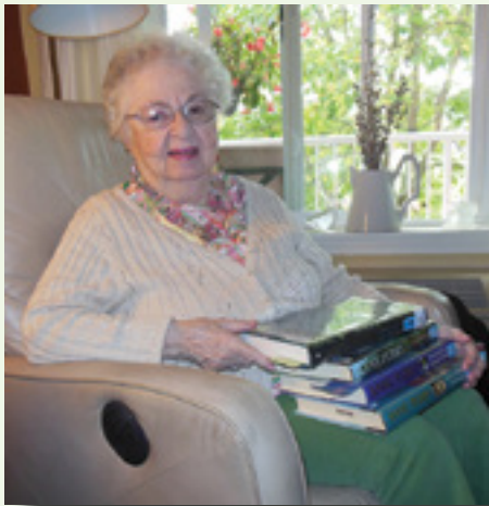
Home Delivery Service Client