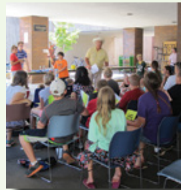
Summer Library Program Teen Prize Auction

(The membership of the Library Board of Trustees was reduced from ten members to nine in 2015.)