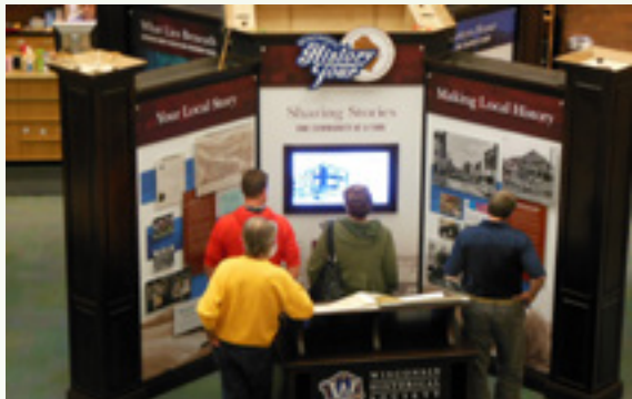
Wisconsin Historical Society Exhibit

The library's mission is to be a source of ideas and information, provided in a wide variety of formats, in order to meet the personal, educational and occupational needs of all its customers, enriching individual lives and contributing to the development and cultural life of the community.