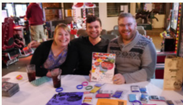
Banned Books Event at The Plus