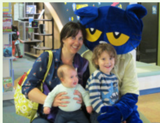
Pete the Cat Event