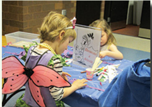
Once Upon a Time Program