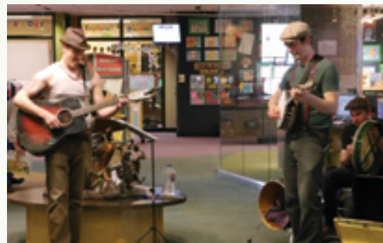
52nd Street Jazz Festival