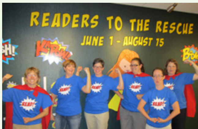
Summer Library Program - Youth Services Staff

Each year, thousands of library visitors view the library's art exhibits, which feature the work of local and regional artists, as well as many displays of interest to children and adults. Wisconsin ArtsWest, the library's annual juried art show, celebrated its 36th year in 2015, attracting 186 entries by 102 artists. Of these, 68 works were selected by the juror and displayed in the library's gallery.