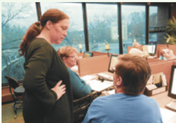
Genealogy Open Lab