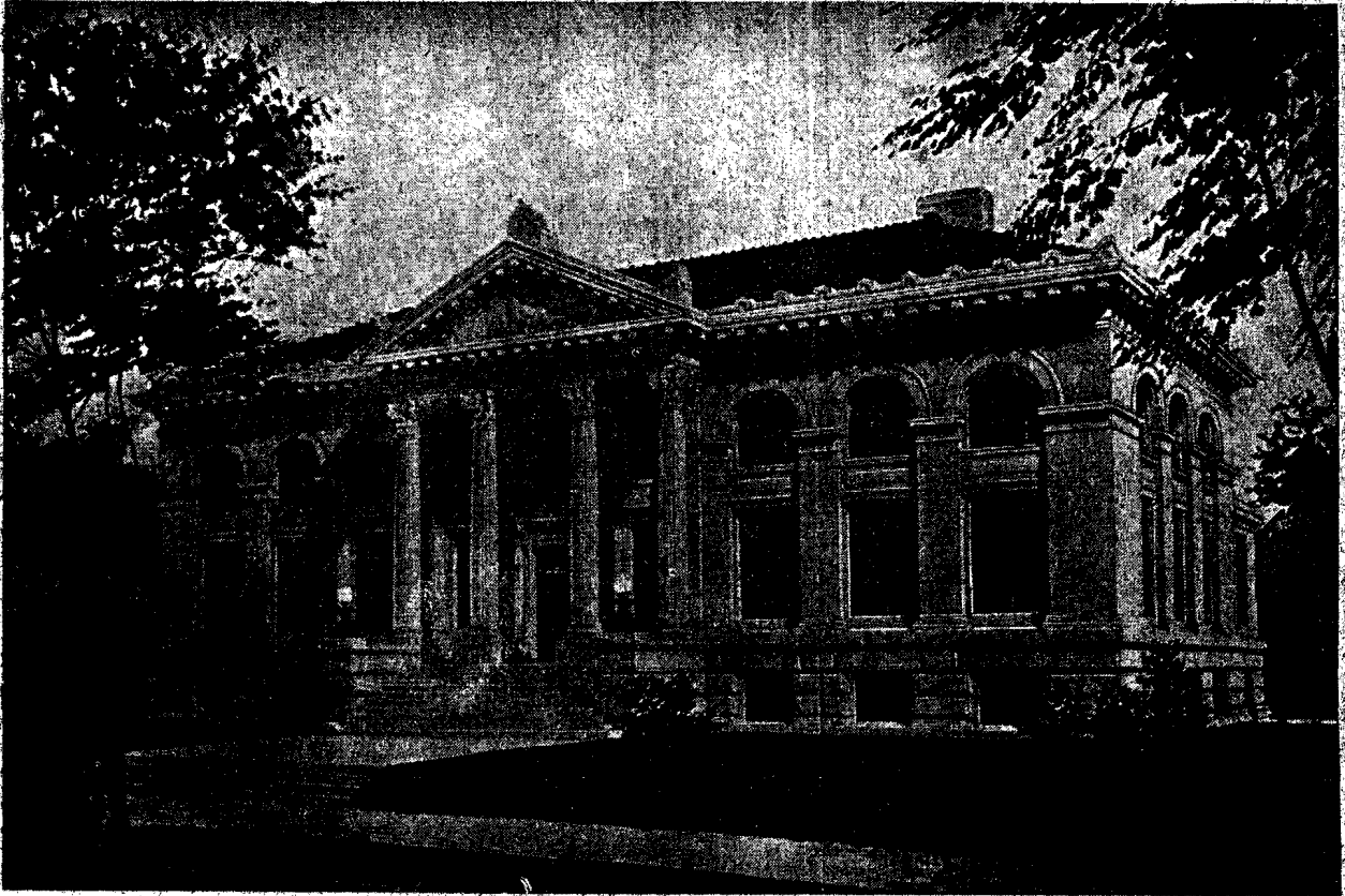
The Gift of Andrew Carnegie to the People of Eau Claire, As It Will Appear When Completed.