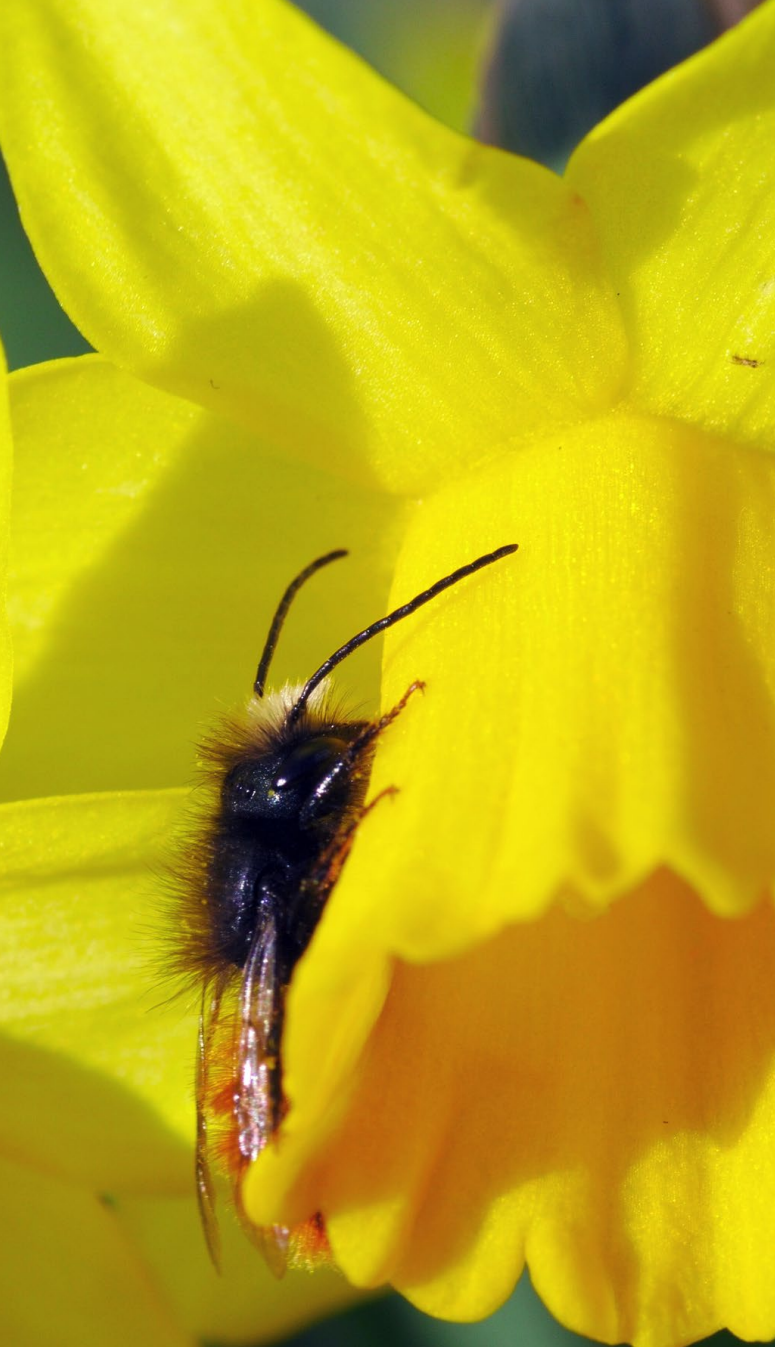
"Mason Bee on Daffodil"